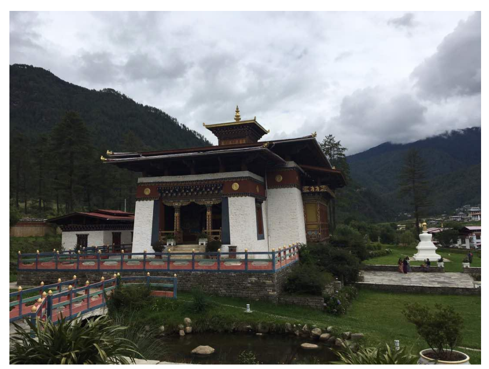
Restoration of the Tara Lhaden Zhingkham Lhakhang at Pangrizampa, Thimphu