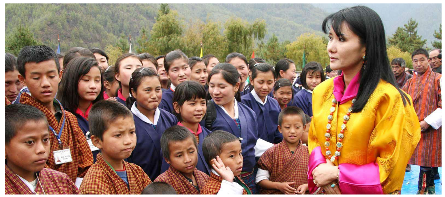
Her Majesty the Queen Mother Gyalyum Sangay Choden Wangchuck with Bhutanese students