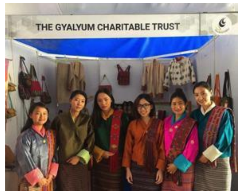
Gyalyum Charitable Trust staff at the CSO Fair