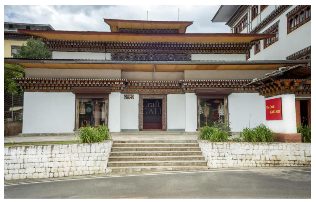
The Craft Gallery located at Building Number 69, Norzin Lam, Chubachhu, Thimphu

The Craft Gallery was inaugurated by the patron, Her Majesty the Queen Mother Gyalyum Sangay Choden Wang-chuck and Her Royal Highness Ashi Eeuphelma Choden Wangchuck on April 3rd, 2017.