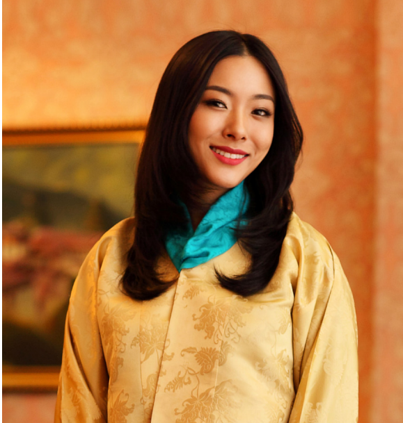
Her Royal Highness Gyelsem Kezang Choden Wangchuck President, GNHCB

Let us remind ourselves of our core motivation to serve as the third arm devoted to promoting the philosophy of His Majesty Drugyel Zhipa. Ours is a commitment to support and augment GNH based development plans and policies of the Royal Government on the one hand and research and conceptual development by scholars and institutions on the other. Our purpose as a civil society organization is to create and offer opportunities to citizens and others of all ages, gender and walks of life to understand, experience and internalize the values of GNH. Our deeper aspiration is to see our homeland becoming a GNH society that will ultimately inspire and transform all of humanity. It is our conviction that in being