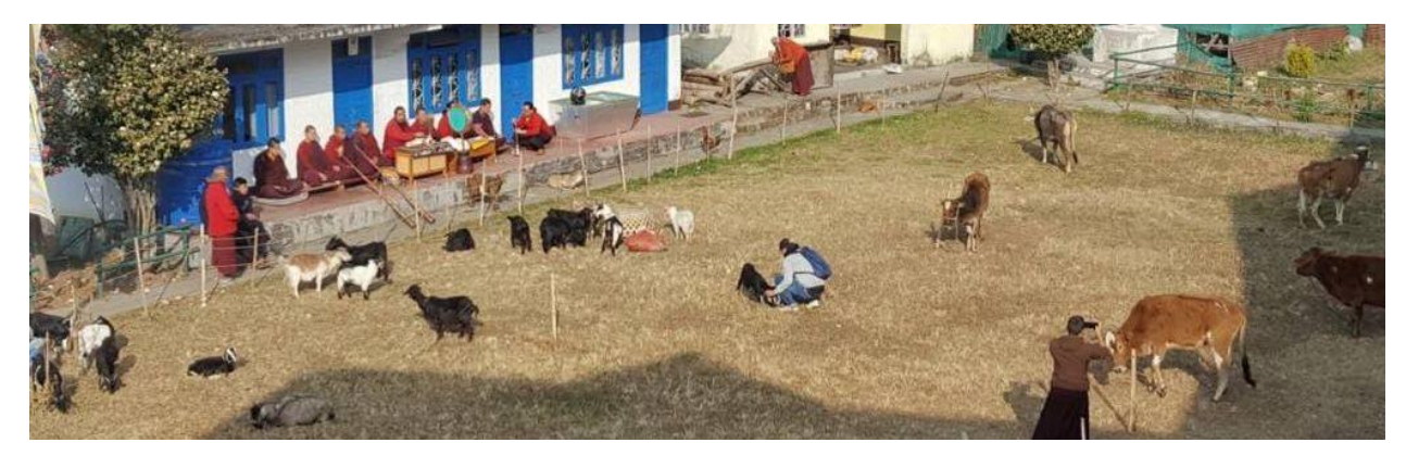
Tsethar of some animals carried out in 2018