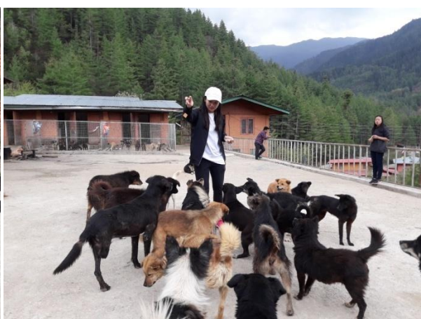
Young volunteers at the shelter