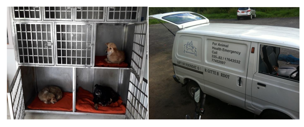
Emergency ward at NVH