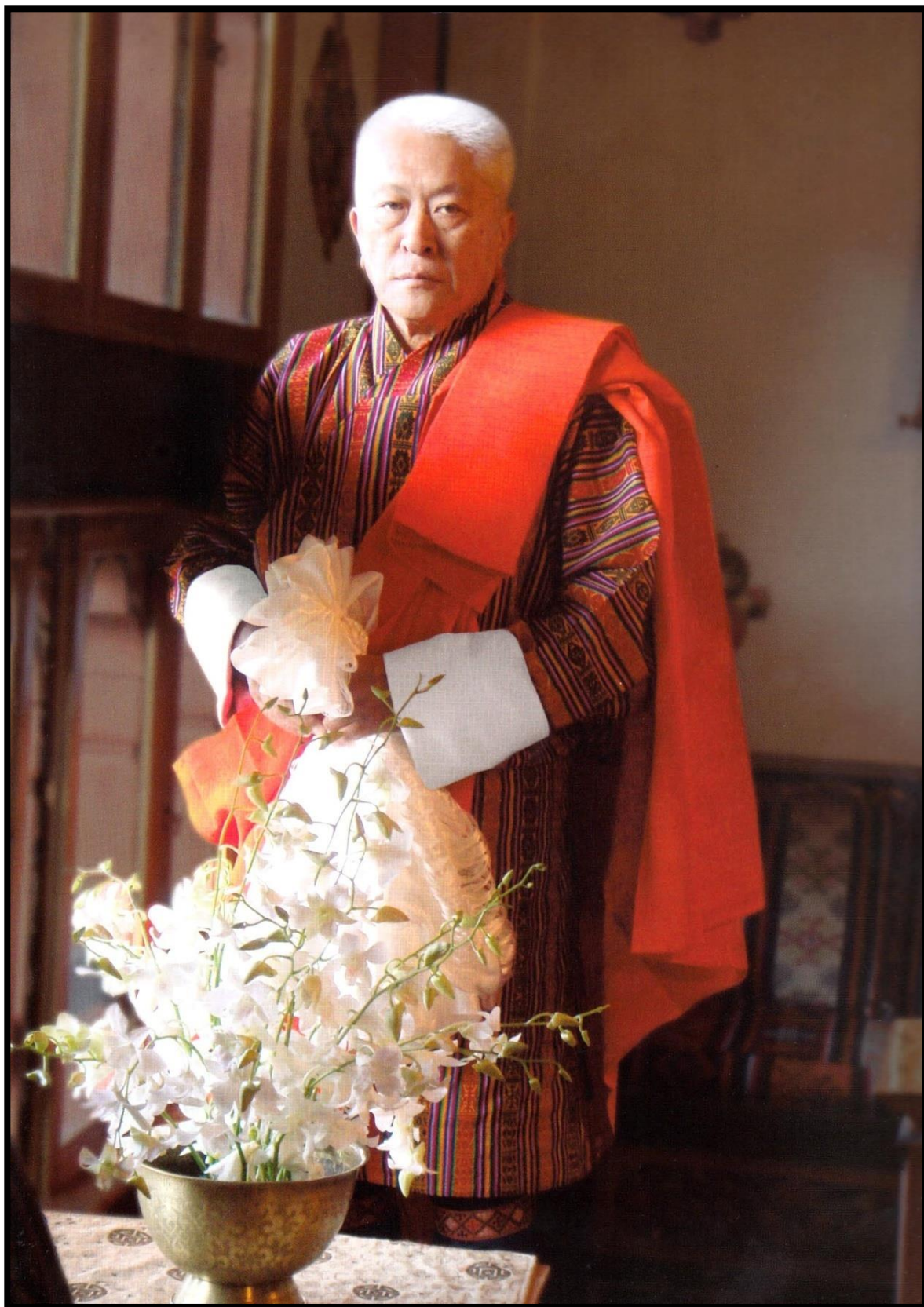
Patron-His Royal Highness Prince Namgyel Wangchuk