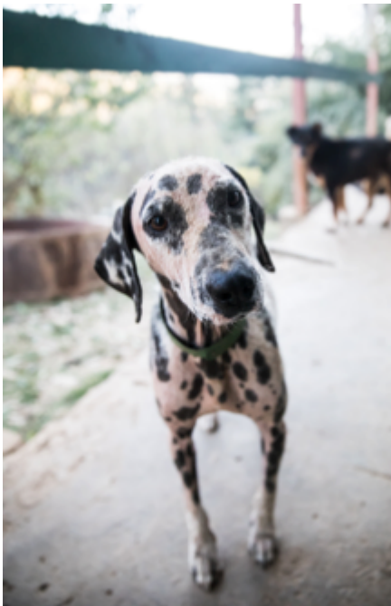
'Fendi', Dalmatian from the cruel puppy farms of India, chronic skin disease and genetic weaknesses due to in-breeding and malnutrition