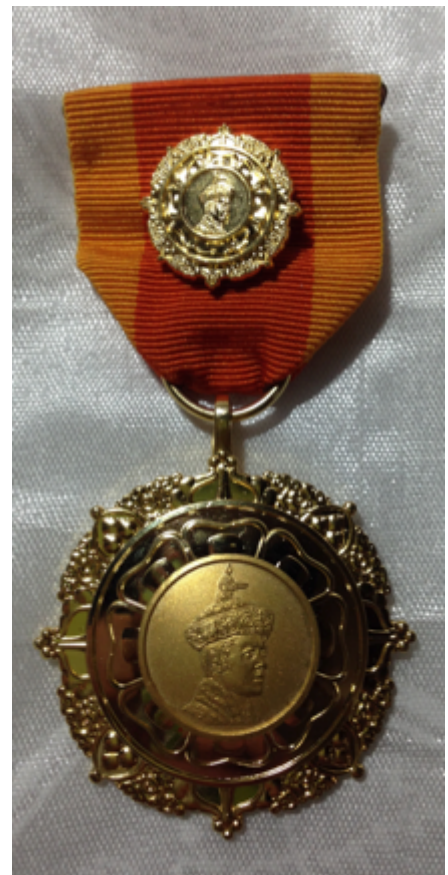
National Order of Merit, Gold

BARC received the National Order of Merit Gold, from His Majesty The King , on National Day, "For volunteering time and effort towards promoting humanitarian values, our culture and tradition, and our national objectives; for working passionately and tirelessly for the benefit of others; for taking on the responsibility to provide support and assistance wherever the government is unable to reach, and for keeping alive the sacred values of compassion and empathy."