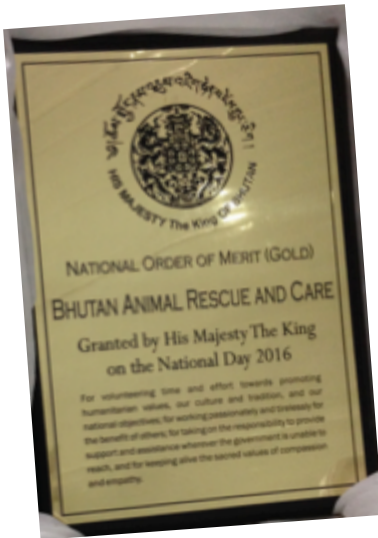
Plaque National Order of Merit, Gold

BARC participated in the CSO Fair with a stand to promote its animal welfare and rescue work, and provided a free pet clinic. The work of BARC was much appreciated by Her Majesty The Queen, who paid a prolonged visit to the BARC stand.