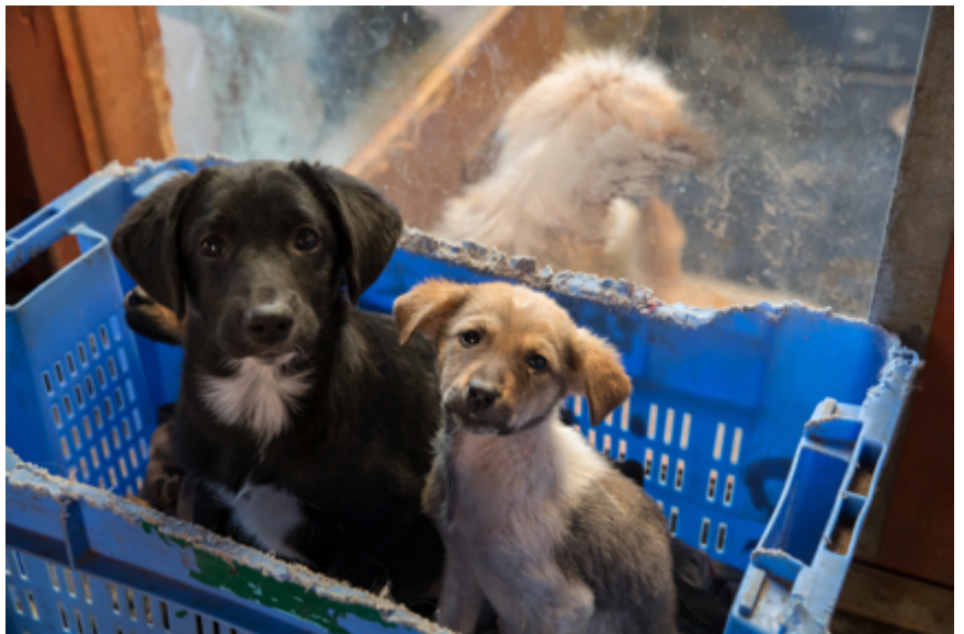
BARC provides a home to all animals in need

BARC conducted maintenance and repair on the animal rescue center at Yusupang, and improved on functionalities of facilities. Two dog cages/pounds were constructed to accommodate more free dogs, especially for paraplegic dogs (car accidents and neurological diseases). BARC also developed its website to increase outreach and transparency.