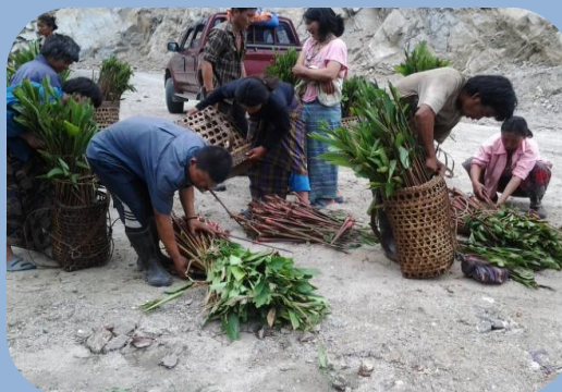
Cardamom group in Trong, Zhemgang