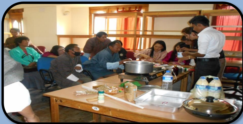
FK participant training the vendors on dairy products