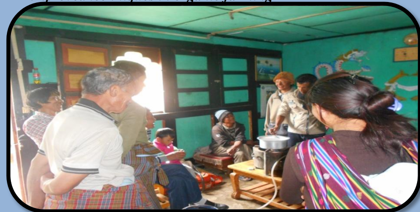
FK Participant training the farmers of Paro on dairy products and its diversification