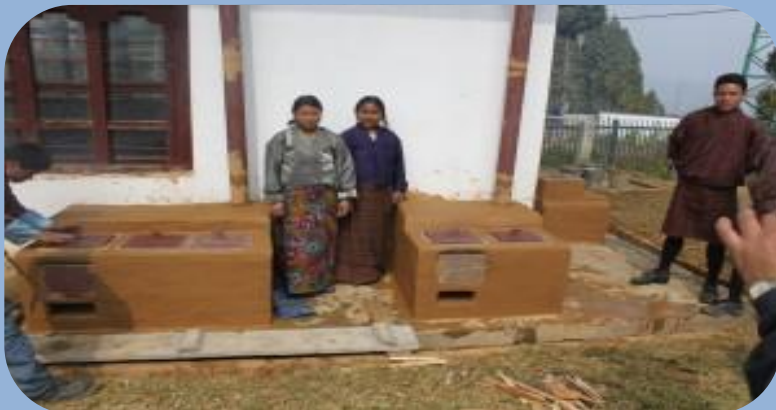
BAOWE team and village technicians- In the making of improved stoves