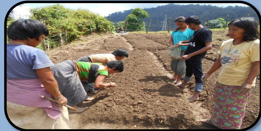
FK participant training the farmers of Zhemgang on new and improved techniques in organic farming