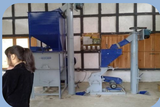
Feed Mill Unit in Lumang, Trashigang