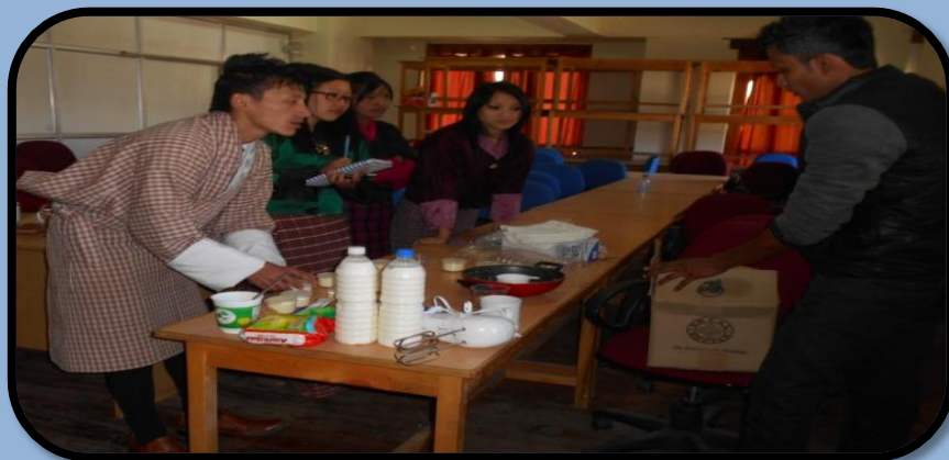
FK participant training the members of youth Business Cooperative on dairy products