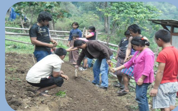
Vegetable group in Nangkhor, Zhemgang