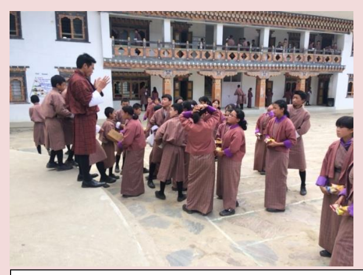
Fig.5 Students getting refreshment after plantation