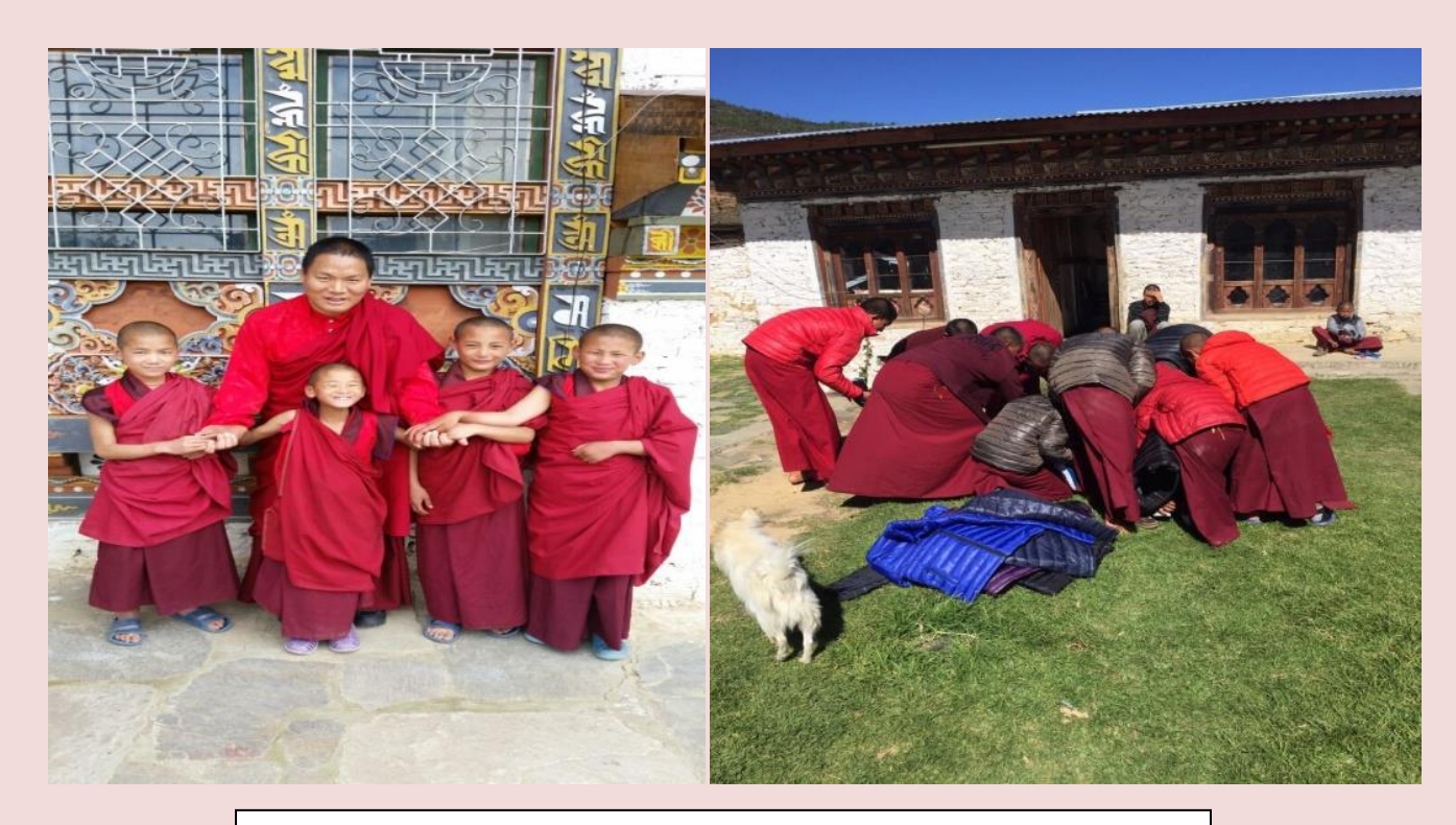
Fig. 9 some of the young monks got new robes for the cold winter

The young monks of Dobji dzong have to deal with quite strong and constantly cold wind, everyday. The monks studying there, who are all from poor family background and were seen suffering through the cold weather without warm clothing is absolutely very hard to imagine. Therefore, the foundation took initiative to provide some of the very poor monks Robes to keep them warm during the severe winter seasons. The monks were very happy to get new set of Robes and jacket.