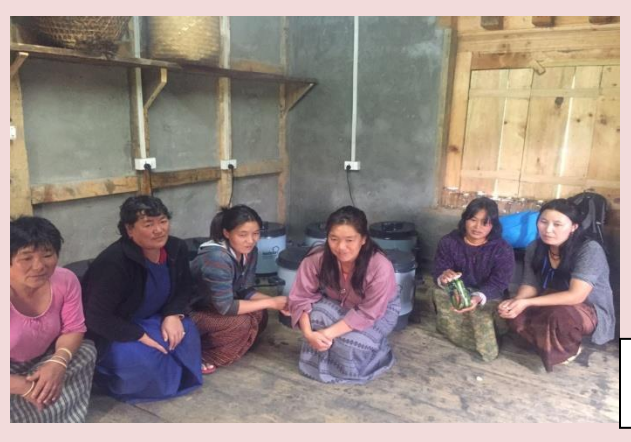
Fig.8 these six young women are now well trained and talented about preserving cookers

Twice in a year our local experts and also guests travelling from abroad; travelling on their own expense and who are motivated to bring positive changes on the lives of the socially disadvantaged people visit the Chendebji village and instruct the young talented people there. They have basic education and therefore it is easy, valuable and also it is a great advantage for us to teach them about hygiene, sanitation and nutrition. Menjong Foundation provided seven numbers of electric preserving cookers and three thousand glass jars (1-2 liters capacity) to the thirty households of Chendebji community. During our survey, we found out that the villagers could not preserve their product due to lack of proper equipment and facilities thus contributing to poverty and less nutritious diet. Although in summer all kinds of fruits and vegetables grow in Chendebji but during the winter and off seasons, people there have no fruits and vegetables at all. This problem expected to be solved through our Food Preservation Project. One of our Staffs travelled to Europe at her own expense and got trained in Germany, about food preservation and one food preservation specialist came to Bhutan to assist and train the people in Chendebji about how to preserve food. Through this project, we would like to improve the quality of the lives of the people living in the remote areas of Bhutan starting with Chendebji.