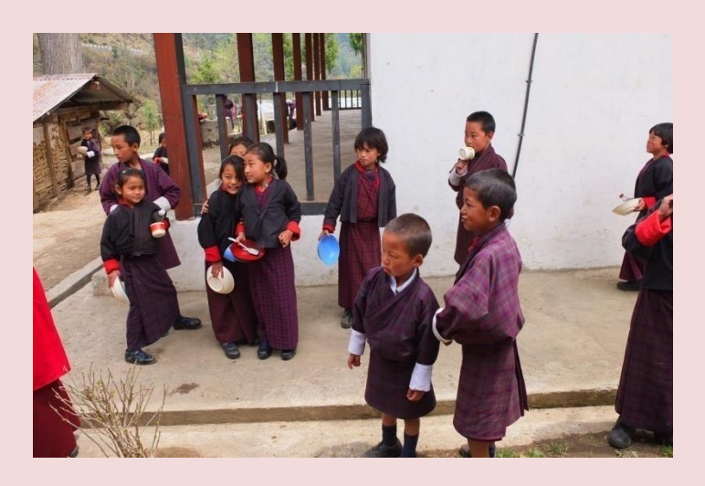
Fig. 2. Students are smiling and they are happy after their meal