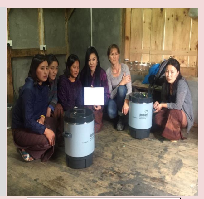
Fig.7 Local villagers getting training