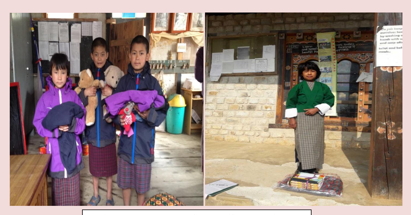
Fig. 3 students got new set of school uniform and stationery