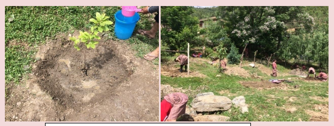
Fig.4 Students of Zilukha MSS planting fruit trees

Menjong Foundation believes that long-term sustainability of our earth lies in protecting our environment and the Bhutanese constitution stipulates that at least 70% of land remains forested at all times. Tree planting is the process of transplanting tree seedlings, generally for forestry, land reclamation, or landscaping purpose. This year we decided to plant fruit trees during social Forestry day on 2<sup>nd</sup> of june 2017. The foundation provided forty fruits trees saplings and refreshment to students including teachers. Chief Guest and the guest inaugurated the plantation.