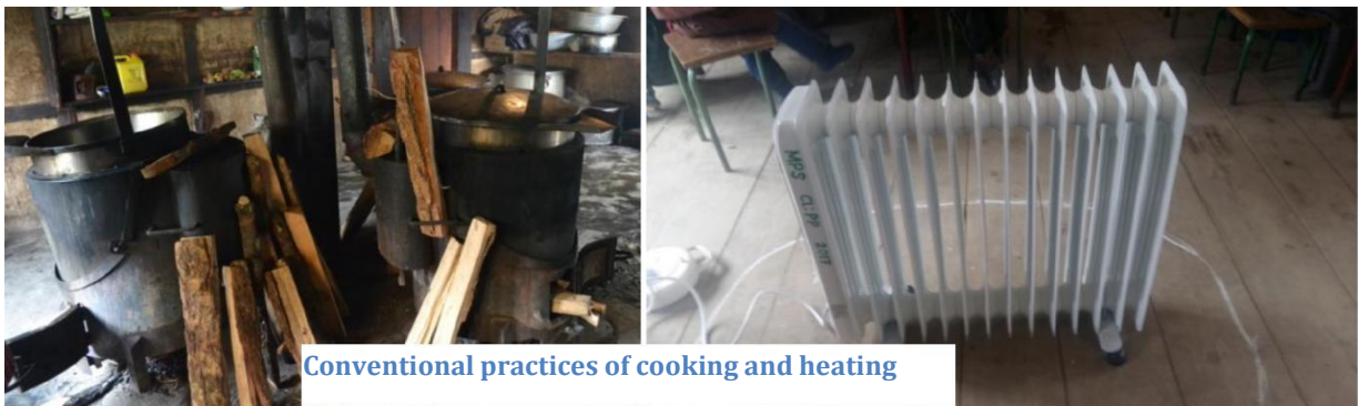
Conventional practices of cooking and heating

While ensuring better place for student, the project also enhance sustainable uses of scarce alpine forest resources through modern intervention by introducing electric utensils and appliances. The project was implemented after consultation with the ministry of education, after having found out that the development of schools in the alpine were challenging due to limited resources