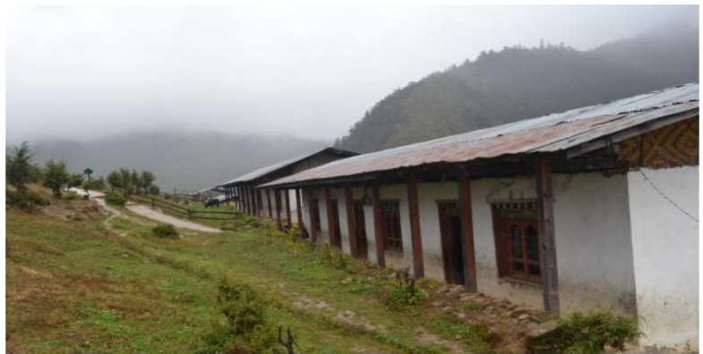
Project implemented site: Merak Primary School (3500 msl)

The project is an initiative to create better learning environment for the student of high altitude school in responses to their harsh climatic condition. Initially, the project is implemented in Merak Primary School (3500 msl) and will be expanded to other five schools located in the alpine region.