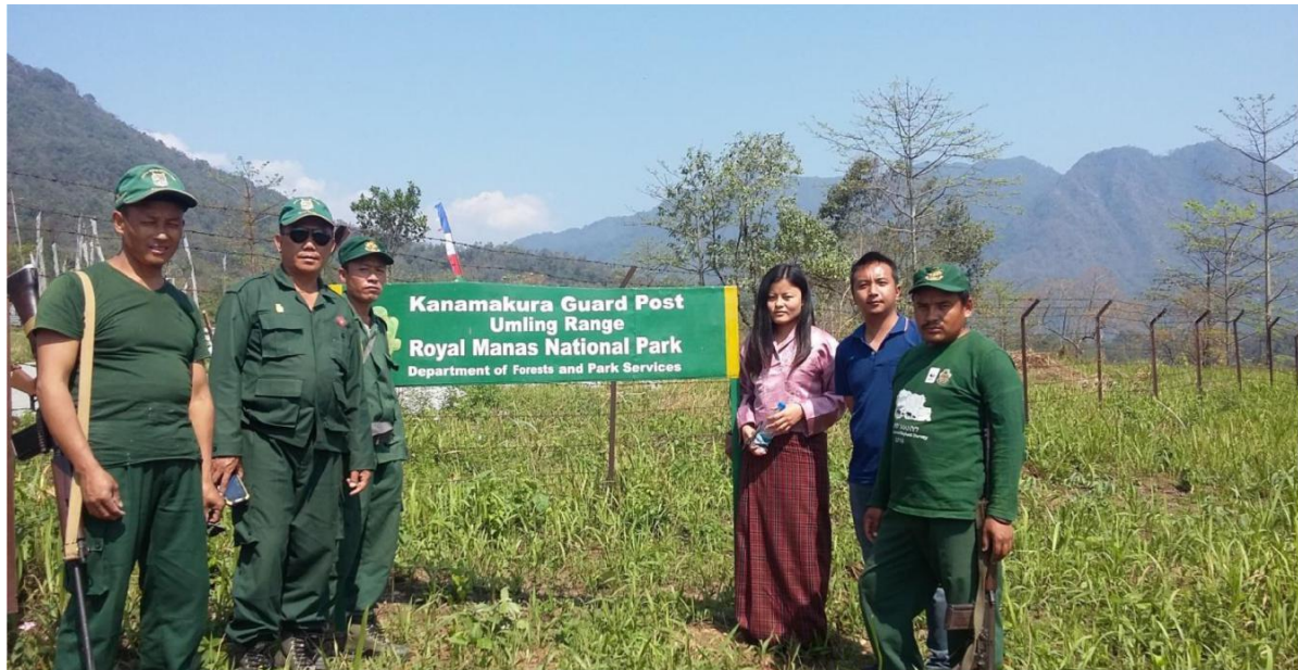
CAITS reviewing team of BES with the Forester of RMNP

The Conservation Assured Tiger Standards (CA|TS) is an accreditation scheme that encourages tiger conservation areas to meet a set of standards and criteria, created by an