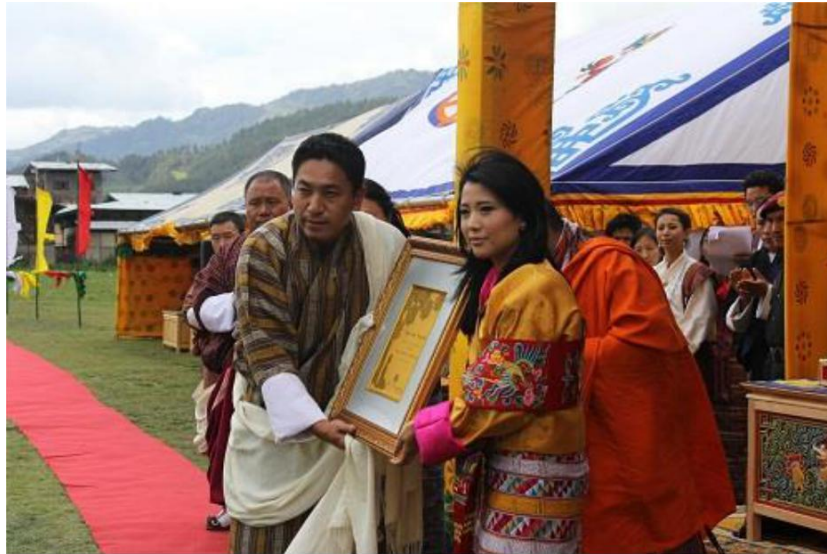
HRH highness Ashi Chimi Yangzom Wangchuck with the team Forest Protection and Surveillance Unit (Winner 2014)