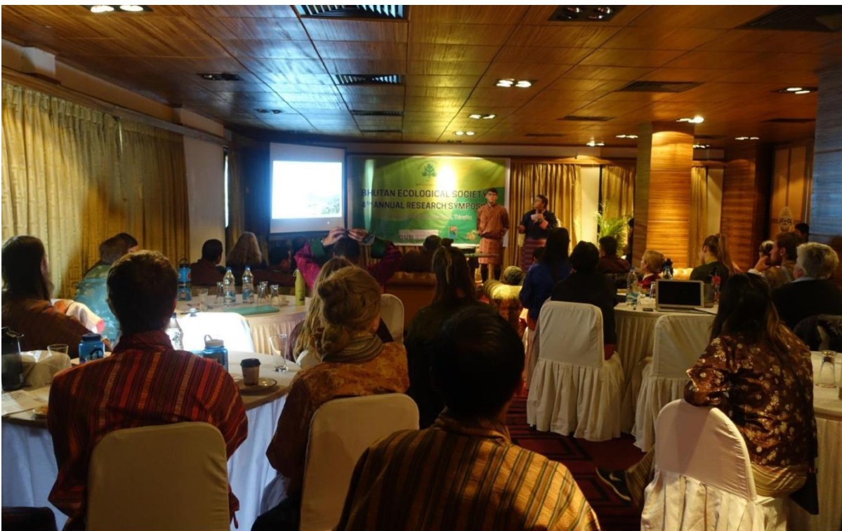
Researchers during symposium: cross-breeding ecological knowledge

Annual Research Symposium and environmental fair is an annual event for Bhutan Ecological Society. It was started in 2013 while BES was in housed at Ugyen Wangchuck Institute for Conservation and Environment Research with the Department of Forest and