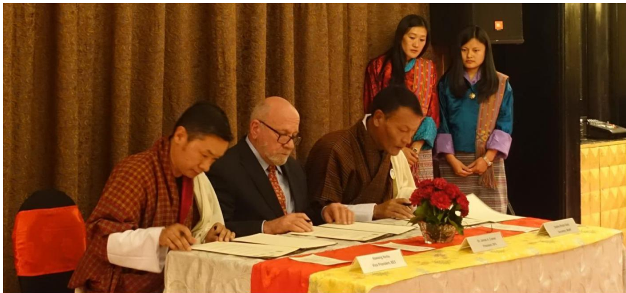
MoU signed (from Left-Right): Vice President of BES, President of SFS & Secretary of MoAF

The trilateral Memorandum of Understanding (MoU) was drawn between the Bhutan Ecological Society (BES), Ugyen Wangchuck Institute for Conservation and Environmental Research (UWICER) and the School For field Studies (SFS), a non-profit organization Based