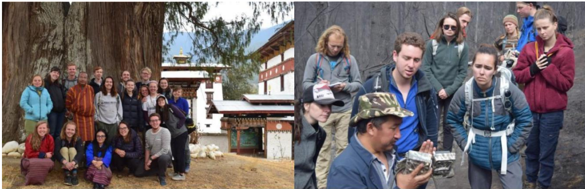
Student of SFS in the field during their Directed Research work

With recent MoU signed, the society has successfully hosted summer and spring semester, 2017-2018, offering courses to 40 undergraduates of US. The SFS Centre in Bhutan is located in Paro.